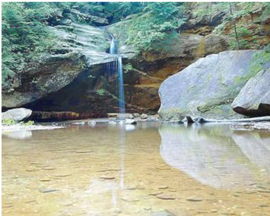
The enchanting Ngwo Pine Forest and Cave: A hidden gem, Enugu State

Our first destination feels like something out of a fairytale. Welcome to the Ngwo Pine Forest, a magical escape tucked away on the outskirts of the bustling Enugu City, aptly nicknamed the Coal City. But take heed: once you set foot in Ngwo, leaving may prove difficult!